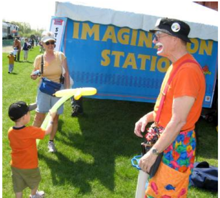
The Balloon Man.