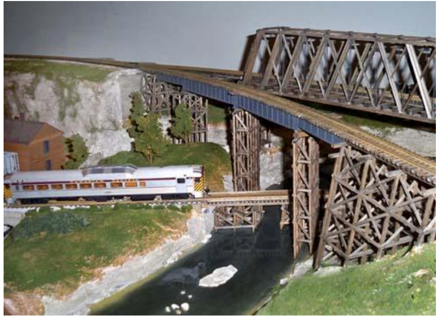
Above: Bill Ball's West Highland Central is an operations based layout with very nice scenery and structures.

Carolyn and I had a good time, got to visit with folks we had met at previous conventions, and learned a lot. I've got plenty of new ideas to think about for my layout.