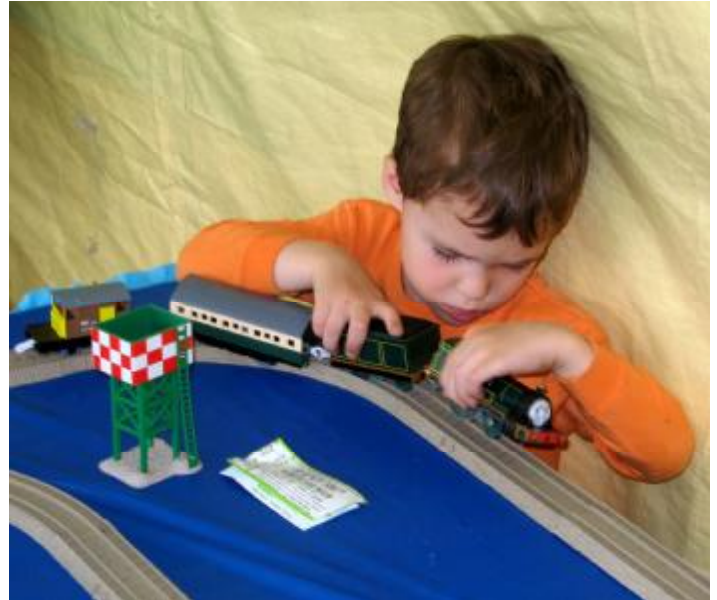
A serious future model railroader.