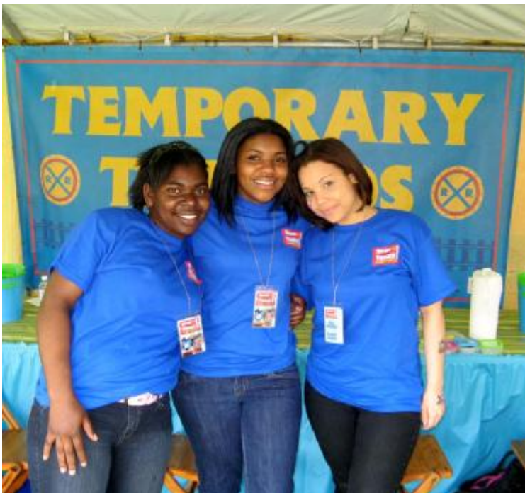
Volunteer students from the Iroquois Job Corps.