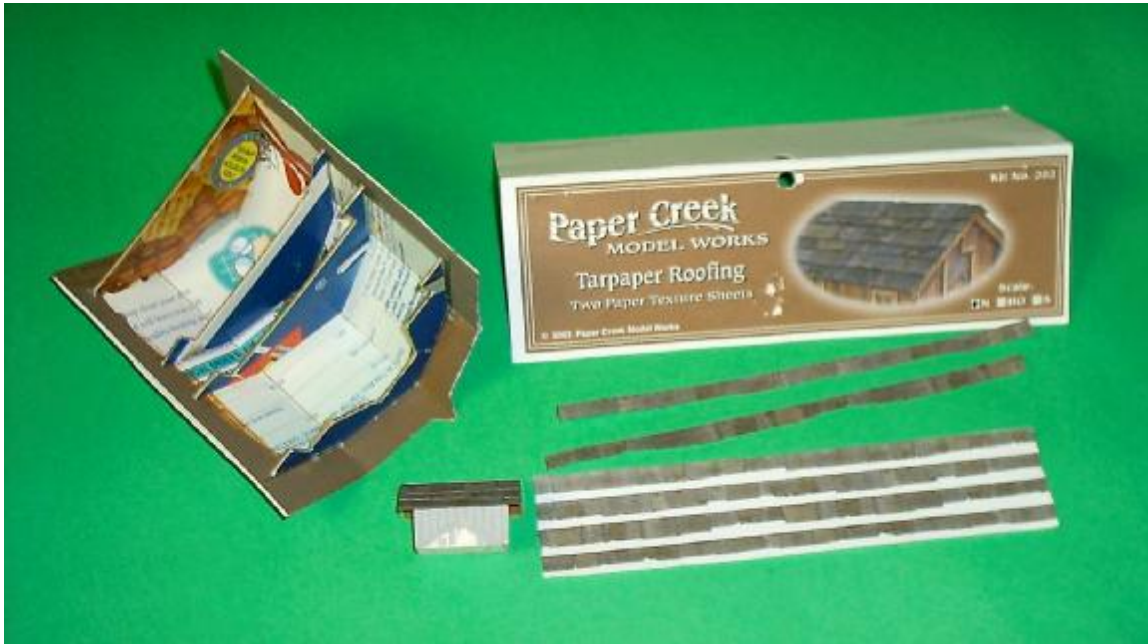
Hoist house with roof, main roof showing supports, and Paper Creek roofing.

Hoist house. The hoist house is a single solid Hydrocal casting, similar to the sides and ends of the main barn. It needed to be cleaned up and prepared as described in the RMR June issue. In addition, the base was squared up with the sides, and the roof surfaces were sanded flat. Walls and trim were painted to match the main building. There appears to be open windows in each end, despite the fact that the casting is solid. I painted these openings dark grey, negating the need for interior details.